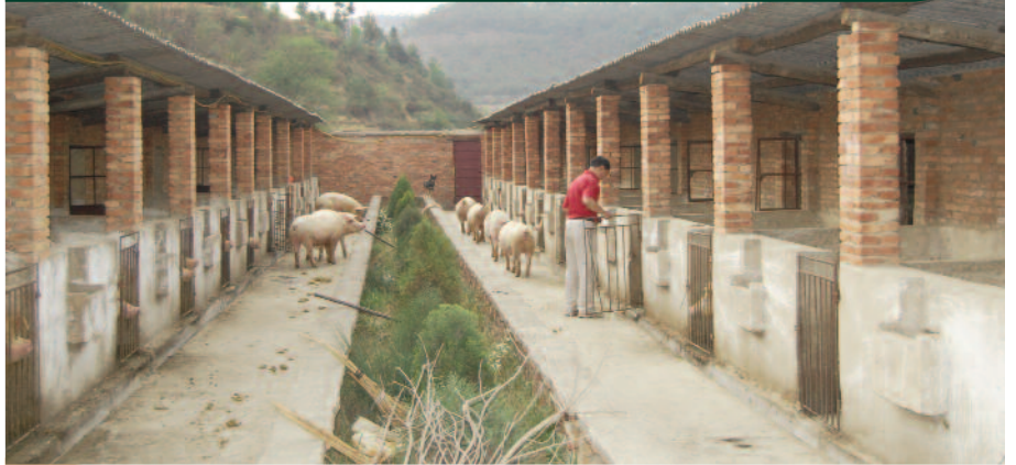
Pork production around Qujing in Yunnan Province, China. Setting up a new generation of agricultural cooperatives

As its 25 th anniversary nears, SOCODEVI is expanding its borders. Under a project to set up agricultural cooperatives, thousands of farming families in Qujing City, Yunnan, China will benefit from the organizational and technical expertise of the Coop fédérée and SOCODEVI.